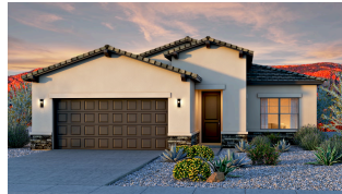
Tabitha II Craftsman Tile Roof