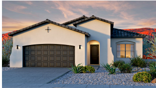
Tabitha II Mission Tile Roof