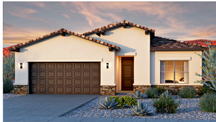
Tabitha II Craftsman Tile Roof