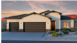
Tabitha II Craftsman 3 Car Tile Roof