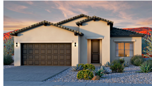
Tabitha II Craftsman w/out Stone Tile Roof

Homes may be built in reverse of plans shown, depending on site conditions. Minor architectural changes may be made occasionally at the option of the builder. Printed material is not date stamped. Prices are subject to change. Please reference Abrazo Homes' website for most updated and accurate pricing and information. Please contact your Sales Consultant for details.