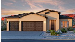
Tabitha II Craftsman w/out Stone 3 Car Tile Roof