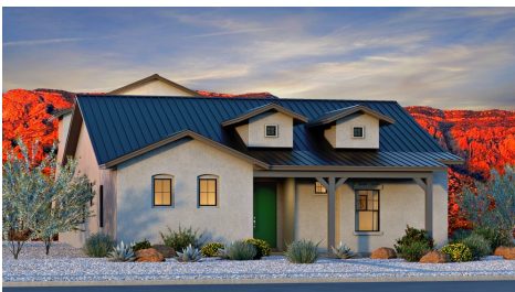
Northern New Mexico Elevation with Casita

Homes may be built in reverse of plans shown, depending on site conditions. Minor architectural changes may be made occasionally at the option of the builder. Printed material is not date stamped. Prices are subject to change. Please reference Abrazo Homes' website for most updated and accurate pricing and information. Please contact your Sales Consultant for details.