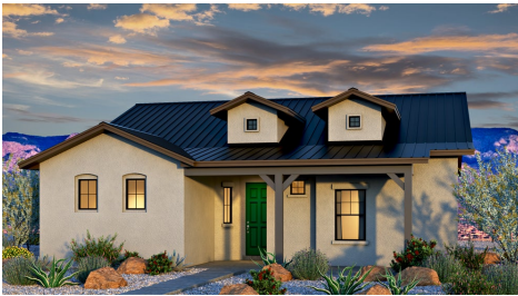
Northern New Mexican Elevation

The layout includes a large kitchen island and a smartly designed work center off the kitchen, optimizing space without sacrificing style. Enjoy outdoor living with a covered patio, with options for expansion to maximize New Mexico's beautiful weather. "The IPA" combines thoughtful design with functional living, ensuring no space is wasted. Experience the perfect blend of comfort and convenience in a home designed for modern living.