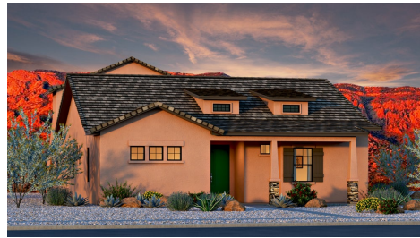
Craftsman Elevation with Casita