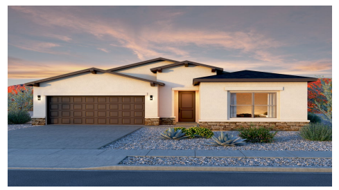
Homes man be builts in the verified for the builder. Printed material is the stamped. Prices are subject to change. Please reference Abrazo Homes' website for most updated and accurate pricing and information. Please contact your Sales Consultant for details.