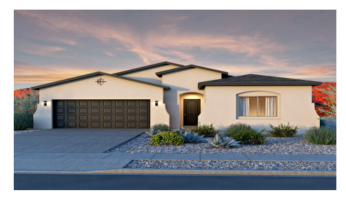
Tabitha II Mission Junior Suite Shingle Roof