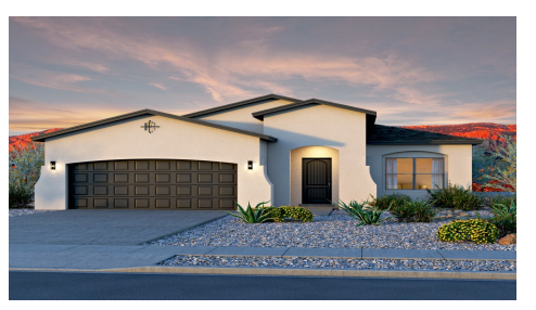
Tabitha II Mission Shingle Roof