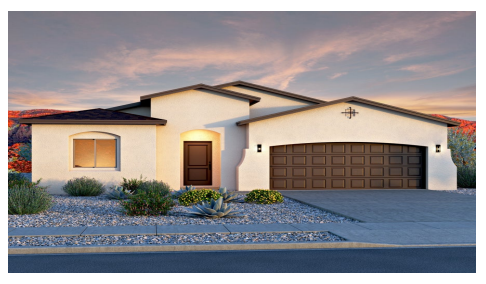
Tabitha II Mission 4th Bedroom Shingle Roof