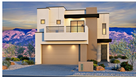
Modern Elevation with open deck