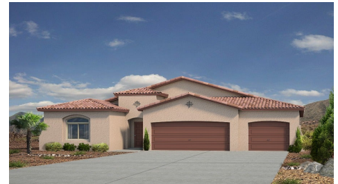
Marilyn II Mission Tile Roof

Homes may be built in reverse of plans shown, depending on site conditions. Minor architectural changes may be made occasionally at the option of the builder. Printed material is not date stamped. Prices are subject to change. Please reference Abrazo Homes' website for most updated and accurate pricing and information. Please contact your Sales Consultant for details.