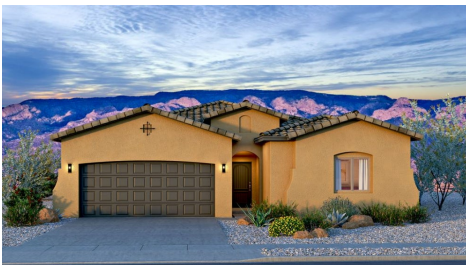
Jane Mission Tile Roof

Introducing the "Jane" floor plan, a single-story haven designed with an open concept, perfect for those who love to entertain. The heart of this home is a versatile work center, serving as an ideal 'drop zone' for mail and keys while doubling as a functional workspace. For added convenience, the work center can be transformed into an optional powder room. The plan boasts a primary suite with an oversized shower, a buffet in the dining area, and an expansive covered patio. Additionally, a tandem garage offers flexibility for conversion into a versatile flex space. In honor of Jane Addams, this home embodies a spirit of community and functionality.