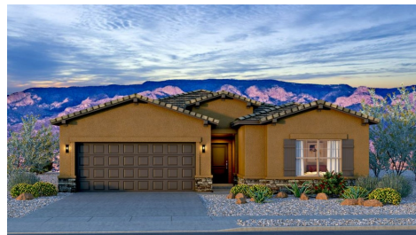
Jane Craftsman Tile Roof

Homes may be built in reverse of plans shown, depending on site conditions. Minor architectural changes may be made occasionally at the option of the builder. Printed material is not date stamped. Prices are subject to change. Please reference Abrazo Homes' website for most updated and accurate pricing and information. Please contact your Sales Consultant for details.