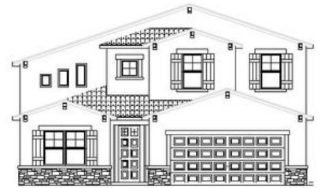
FRONT OPT. CRAFTSMAN ELEVATION W/OPT. CASITA

Homes may be built in reverse of plans shown, depending on site conditions. Minor architectural changes may be made occasionally at the option of the builder. Printed material is not date stamped. Prices are subject to change. Please reference Abrazo Homes' website for most updated and accurate pricing and information. Please contact your Sales Consultant for details.