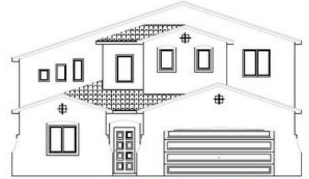
FRONT ELEVATION W/OPT. CASITA