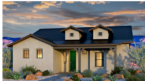
Northern New Mexican Elevation

Homes may be built in reverse of plans shown, depending on site conditions. Minor architectural changes may be made occasionally at the option of the builder. Printed material is not date stamped. Prices are subject to change. Please reference Abrazo Homes' website for most updated and accurate pricing and information. Please contact your Sales Consultant for details.