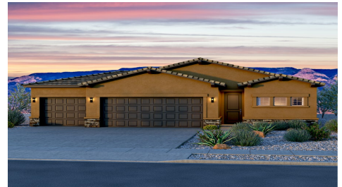
Maya - Craftsman - 3rd Car - TileRoof