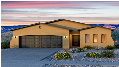
Maya - Mission - ShingleRoof