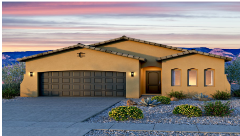
Maya - Mission - TileRoof

Introducing the "Maya" floor plan. This ready-to-be-built home showcases a distinctive elevation, featuring an entertainer's kitchen with a bar top seamlessly connecting to the spacious great room. The primary suite boasts a generous walk-in closet, while optional vaulted ceilings in the great room create a sense of openness. Discover the charm that earned the "Maya" floor plan the prestigious 'Buyer's Choice Award' in the Parade of Homes. In honor of Maya Angelou, this home is designed to inspire and uplift.