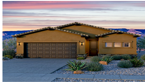
Maya - Craftsman - TileRoof