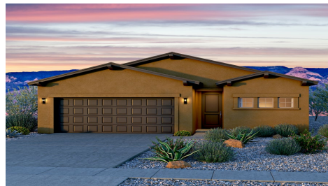
Maya - Craftsman w/Out Stone - ShingleRoof