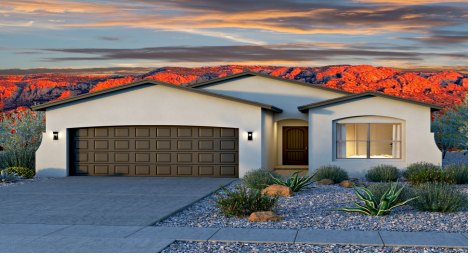
Frida - Mission - Shingle Roof