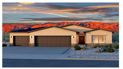
Frida - Craftsman w/Stone; 3 Car - Tile Roof