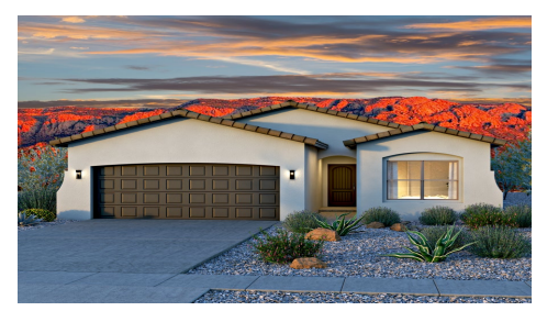
Frida - Mission - Tile Roof

Introducing the "Frida" floor plan, Abrazo's inaugural creation, meticulously refined and perfected over the years. This single-story home features three bedrooms and two baths, seamlessly balancing functionality with affordability. The "Frida" offers a spacious primary bedroom, ensuring comfort and relaxation, and includes a covered porch for outdoor enjoyment. Discover a thoughtfully designed layout that checks all the boxes. In honor of Frida Kahlo, this home pays homage to artistic spirit and timeless allure.