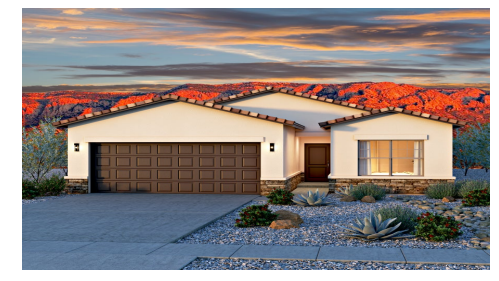
Frida - Craftsman w/Stone - Tile Roof

Homes may be built in reverse of plans shown, depending on site conditions. Minor architectural changes may be made occasionally at the option of the builder. Printed material is not date stamped. Prices are subject to change. Please reference Abrazo Homes' website for most updated and accurate pricing and information. Please contact your Sales Consultant for details.