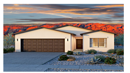
Frida - Craftsman w/Stone - Shingle Roof