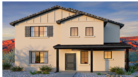
2213 - The Cabernet Farmhouse

Homes may be built in reverse of plans shown, depending on site conditions. Minor architectural changes may be made occasionally at the option of the builder. Printed material is not date stamped. Prices are subject to change. Please reference Abrazo Homes' website for most updated and accurate pricing and information. Please contact your Sales Consultant for details.