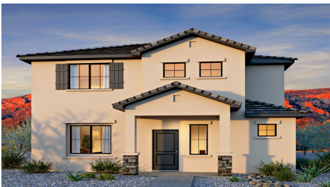
2213 - The Cabernet Cottage

The heart of the home is the large kitchen island that seats four, seamlessly extending into the dining and great rooms—ideal for gatherings. Customize your space with options like a fireplace, an extended buffet in the dining room, or an expanded covered patio. "The Cabernet" promises a home that's as functional as it is inviting.